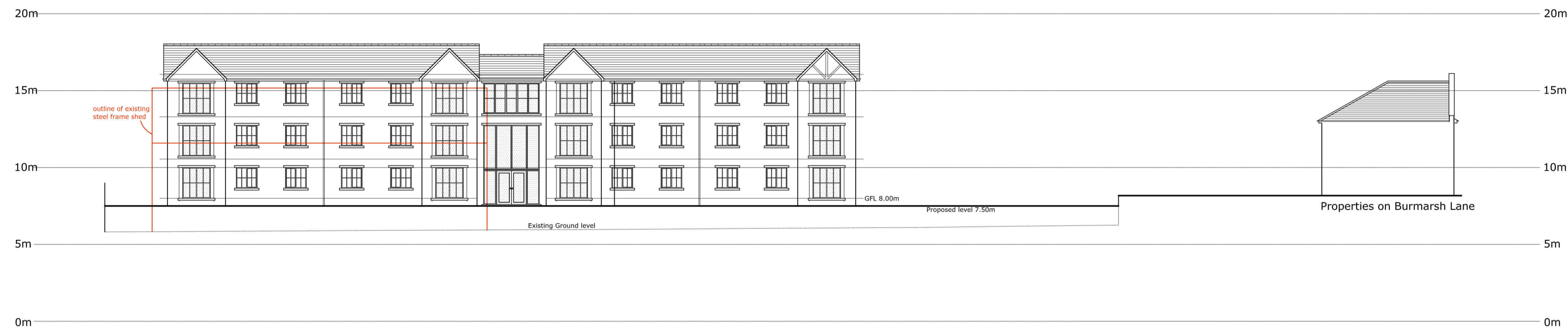
Indicative North West Elevation - for illustrative purposes only 1:200 scale